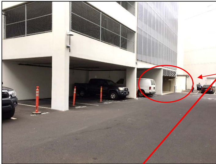
Commercial Space Customer Parking

Interior construction for the Commercial Space located in The Lofts is nearly complete and it'll be open for business soon. 8 of the Commercial Space parking stalls are located in an area where their customers must cross the Lofts Garage Entrance/Exit. Lofts residents exiting the garage may not have adequate time to stop if a pedestrian is crossing the garage entrance/exit.