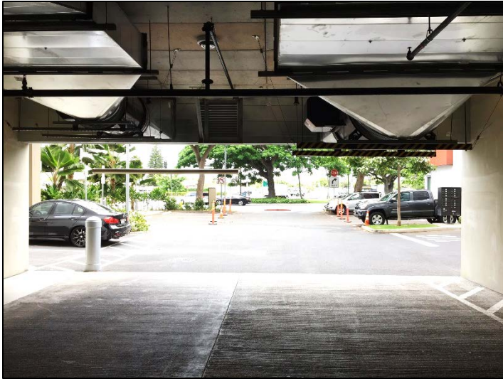
Driver's View Exiting the Lofts Garage.

Difficult to see pedestrian walking from customer parking.