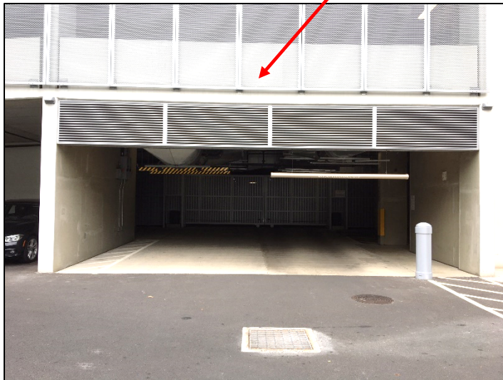
Lofts Garage Entrance / Exit