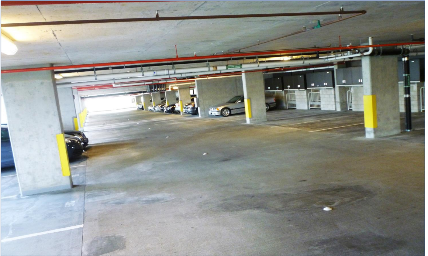
Picture above of Ceramic Discs - Not Reflective Pavement Markers - pic for illustration purposes Discs spaced about 25 feet apart.