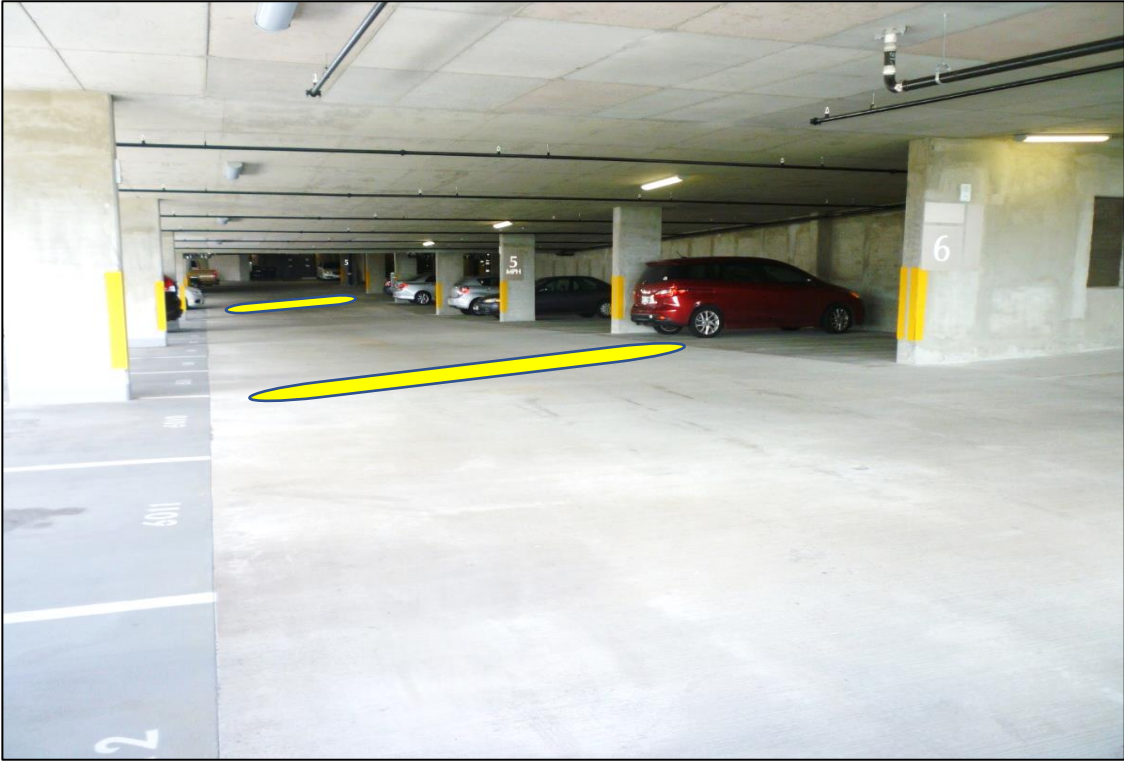
The Speed Bumps would be installed just before the turns. Installed enough distance prior to turns so both front tires arrive simultaneously Lengths will be long enough to prevent cars from going around them.